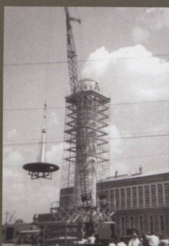
Sceptle being placed on bell tower, circa 1963.

Traditionally church bells are rung on occasions of public joy and gladness and calamity and sorrow. They are identified with the "voice of God" calling the faithful to public worship.