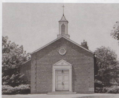
St. Agatha Church 1940's.