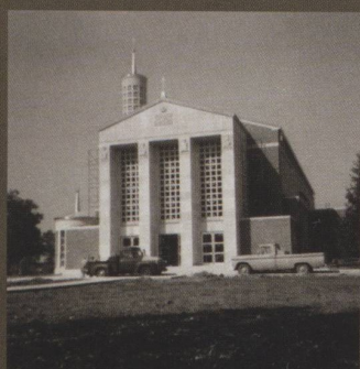
St. Agatha Church in 1963.

St. Agatha Parish was founded in 1940. The first Mass was celebrated on December 1, in a church designed to accommodate 350 people. There were 70 families who became official charter members of the parish.